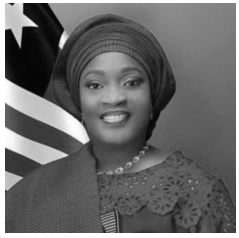
H.E. Dr Jewel Howard-Taylor